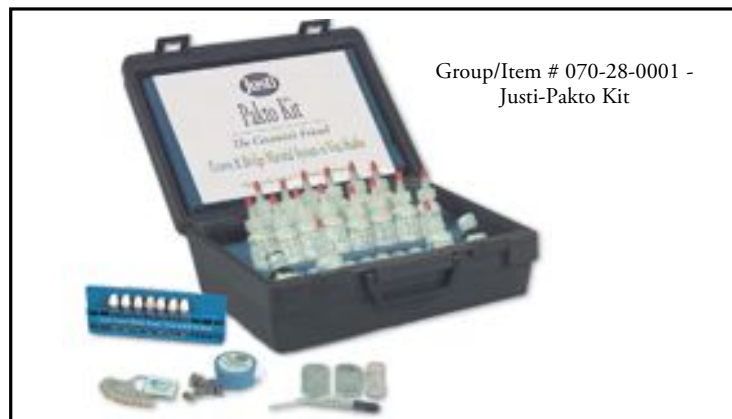
Group/Item # 070-28-0001 - Justi-Pakto Kit