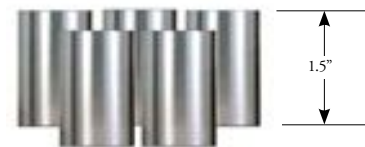
(S) Small appliance 5 per Pkg - 7.9g/tube