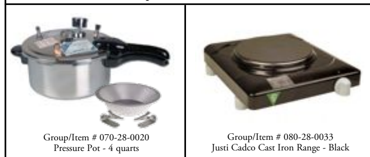
Group/Item # 070-28-0020 Pressure Pot - 4 quarts