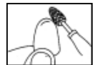
6. Final adjustment for cementation.

Additional questions, to place your order, or for the Dealer nearest you, please call the Tooth Express Order Desk at 800-628-1437.