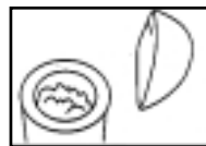
3. Placing the acrylic resin on the facing