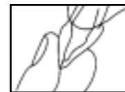
5. Lateral positioning of the facing.