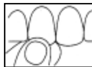
4. Frontal positioning of the facing.