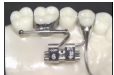
Coil spring in detail