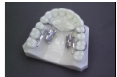
Fast Back on the model