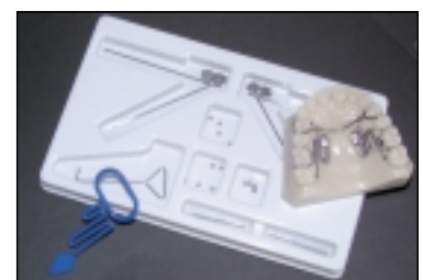
Fast Back Expansor Kit