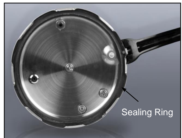
Fig. A. IMPORTANT: NEVER OIL THE SEALING RING.