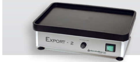
Plate size: 365x265x110 mm It accommodates 6 large cylinders (9x). Weight: 10,5 kg

Vibrator for investments with rectangular plate. Same technical features as the smaller version except: