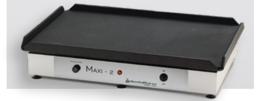
Plate size: 600x400x130 mm It accommodates 18 large cylinders (9x). Weight: 24,7 kg

Vibrator for investments with rectangular plate. The vibration is perfectly vertical and without any dispersion thanks to 3 combined electromagnetic units and 8 shock absorbers assuring uniform vibration all over the plate.