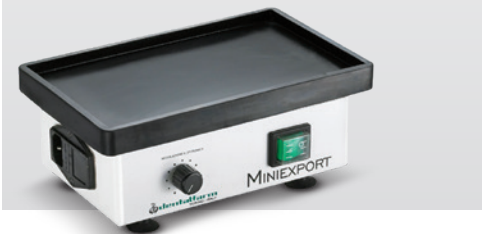
Plate size: 240x150x105mm It accommodates 2 large cylinders (9x). Weight: 5,5 kg

Vibrator for investments with rectangular plate. The vibration is perfectly vertical without any dispersion thanks to 4 shock absorbers and special large suction feet providing uniform vibration. Intensity and width of movement over the plate are controlled by an electronic circuit controlled over a potentiometer.